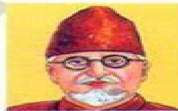
अबुल कलाम आज़ाद Abul Kalam Azad