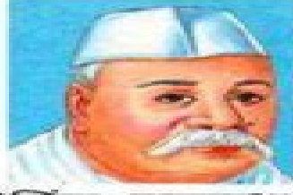
गोविंद वल्लभ पंत Govind Vallabh Pant