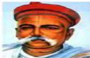
बल गंगाधर तिलक Bal Gangadhar Tilak