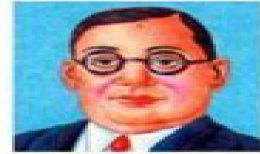
रसबिहारी बसु Rasbihari Basu