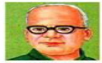
जय प्रकाश नारायण Jai Prakash Narayan