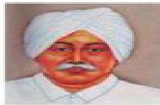
लाला लाजपत राय Lala Lajpat Roy