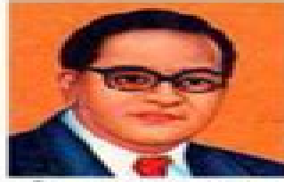
डॉ. बी आर अम्बेडकर Dr. B R Ambedkar