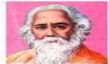
रविन्द्र नाथ टैगोर Rabindra Nath tagore