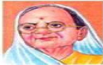
कस्तूरबा गांधी Kasturba Gandhi