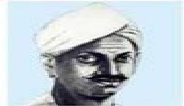
मंगल पांडे Mangal Pande