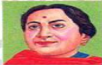
सरोजिनी नायडू Sarojini Naidu