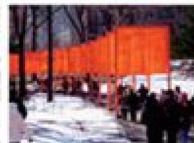
This is a photograph of a sculpture by the artist Robert Rauschenberg. The sculpture is made of a material that looks like stone or concrete, and it has a very rough, textured surface. It is a large, abstract piece that is mounted on a wall.