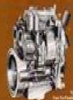
Typical 6-71 In-to-flywheel Model