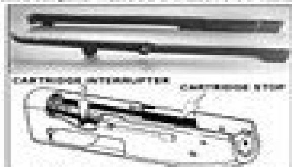
Illustration courtesy of C.A. Mosley & Sons, Inc.

5. REMOVE CARTRIDGE INTERRUPTER & CARTRIDGE STOP. It's possible that these two components may have taken out when you removed the trigger group. You may need to gently tap on the receiver to release these parts. Notice the orientation of the bolts.