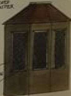
SHARP PICTURE GABLE WINDOW