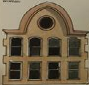
FOUR-LIGHT ENTIRE WINDOW