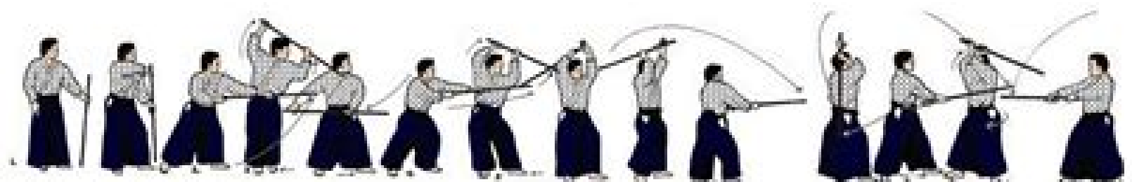
1 KAMAE 2 STUJI 3 Reculer et pivoter (Joshi) 4 STUJI 5 Reculer 6 Laisser la main gauche et avancer le JI par le "pet" 7 SHOMEN UCHI 8 SHOMEN UCHI