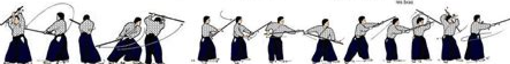
9 Avancer et Planer vers la droite (SHOMEN UCHI - demi-tour) 10 Reculer le pied droit et MAGI DOO 11 Avancer et Frapper en remportant 12 Avancer et tirer un demi-cercle vers la droite 13 Laisser la main droite et tirer le JI vers l'avant 14 Tirer le JI vers l'avant 15 Frapper en SHUJI 16 Reculer et pivoter 17 Planer vers la droite 18 Laisser la main gauche et tirer le JI vers l'avant 19 Tirer le JI vers l'avant 20 Planer vers la droite 21 Laisser la main gauche et tirer le JI vers l'avant 22 Frapper vers l'avant en MAGI DOO