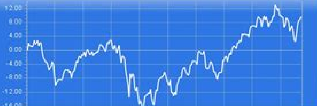
Portfolio YTD Cumulative Return (%)

Portfolio Scope Net TS Rate Period Cumulative Frequency Daily