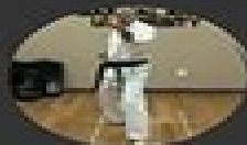
Basics (Kihon) Basic techniques such as punches, kicks, stances, and blocks.