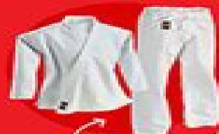
Wear a clean, white karate gi to class.