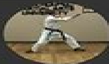
Forms (Kata) A pre-arranged fight or choreographed training sequence integrating several techniques.