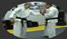
Self-Defense (Baka) (Goshin Jutsu) Specialized self defense techniques address chokes, holds, grabs, and weapon threats.