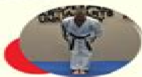
Bow when entering or exiting the dojo.