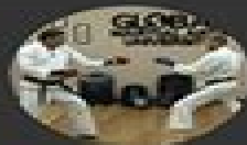
Sparring (Kumite) Sparring practice that begins with controlled one-steps, and then gradually morphs into freestyle sparring.