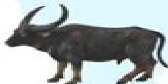
Wild Water Buffalo