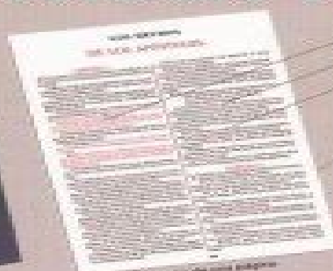
Muestra de una página

Biblia económica manual, Negra... # 15453 Biblia económica manual, Marrón... # 15456 Biblia económica manual, Azul... # 15457