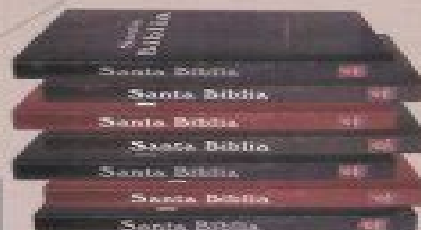
Portadas de colores

5 Ediciones las que se habían juntado la peguntaron: ¿dónde los Señores, ¿prestándoles el reino a Israel en esta manera? Y él les dijo: No voy a mostraros antes las cosas, a los señores que el Padre puede en su sola potencia.