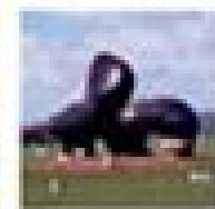
This is a photograph of a sculpture by the artist Joon Yoon. It is a large, dark, and abstract work that is made of many small, dark, and light-colored pieces that are put together to form a larger, more complex shape.