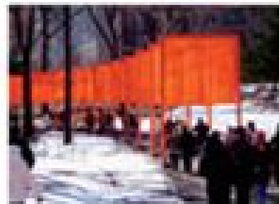
This is a photograph of a sculpture by the artist Joon Yoon. It is a large, dark, and abstract work that is made of many small, dark, and light-colored pieces that are put together to form a larger, more complex shape.