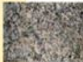
This is a photograph of a sculpture by the artist Robert Rauschenberg. The sculpture is made of a material that looks like stone or concrete, and it has a rough, granular texture. It is a black and white photograph.

The book is divided into two main sections: the first section covers the art of the mid-20th century, and the second section covers the art of the present.