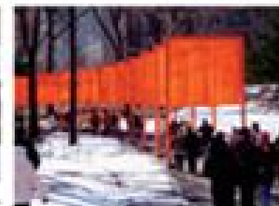
This is a photograph of a sculpture by the artist Joonus Mäkelä. The sculpture is made of a dark, possibly metal, material and has a complex, organic shape that resembles a large, stylized letter 'S' or a twisted, elongated form.