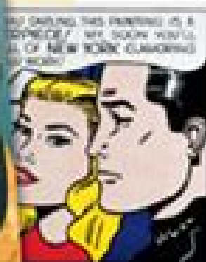
This is a photograph of a painting by the artist Roy Lichtenstein. The painting is titled 'The Kiss' and it depicts a man and a woman in a close embrace. The style is characteristic of Lichtenstein's pop art, with bold lines and a limited color palette.