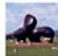
This is a photograph of a sculpture by the artist Joonus Mäkelä. The sculpture is made of a dark, possibly metal, material and has a complex, organic shape that resembles a large, stylized letter 'S' or a twisted, elongated form.