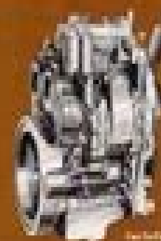
...and the ...

1. Journal of the American Medical Association , 1997; 277: 1001-1005.