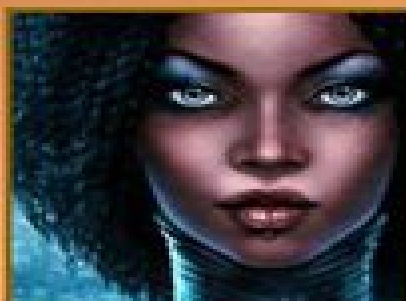
YEMAJA MOTHER GODDESS