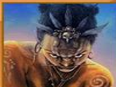
OYA GODDESS OF STORMS