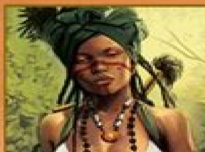
AJA HEALING GODDESS