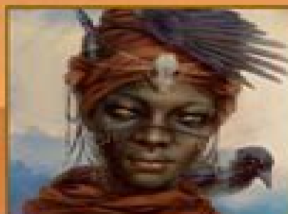
AYAO AIR GODDESS