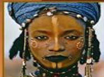
ODUDUA FERTILITY GODDESS