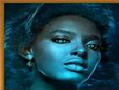
OLOKUN OCEAN GODDESS