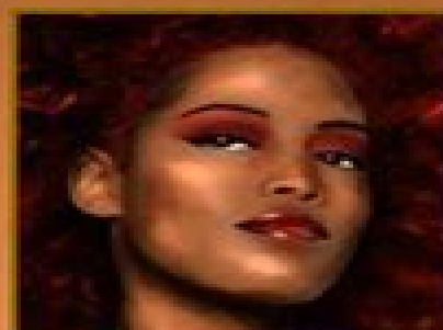
OSHUN FERTILITY GODDESS