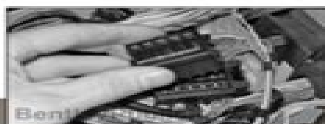
Extensive electrical component location information. 601 Electrical Component Locations