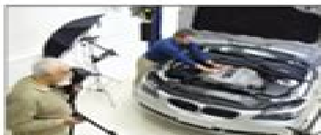
Bentley technical editors removing motor cover on V8 (N62) engine.

The do-it-yourself BMW owner will find this manual indispensable as a source of detailed maintenance and repair information. Even if you have no intention of working on your vehicle, you will find that reading and owning this manual makes it possible to discuss repairs more intelligently with a professional technician.