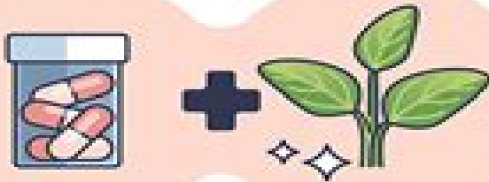
DRUG - HERB INTERACTION