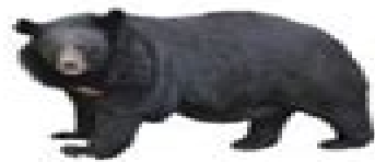
Asiatic Black Bear