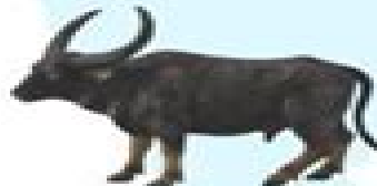
Wild Water Buffalo