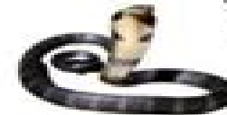
Giant King Cobra