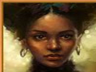
EGUNGUN-OYA GODDESS OF FATE