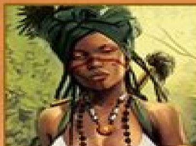
AJÁ HEALING GODDESS