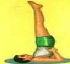
उर्ध्वसर्वांगासन URDHARV SARVANGASAN