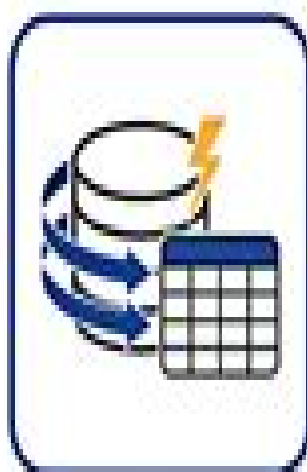
POWER QUERY (Data Connector / Shaper) ("M" Engine)