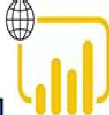
Power BI (Reports / Dashboards)