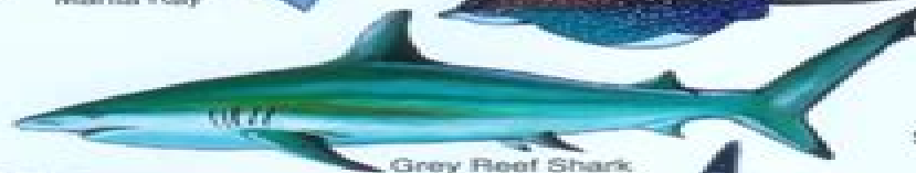
Grey Reef Shark