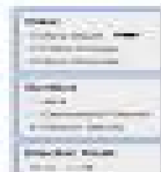
Figure 2: Figure 2

The circumference of a sphere is the same as the circumference of a circle. The circumference of a sphere is the same as the circumference of a circle. The circumference of a sphere is the same as the circumference of a circle.