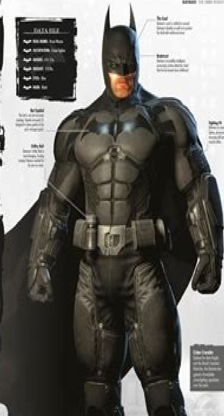
The Suit The suit is a mix of tactical and tactical, making him a symbol of justice in the dark night.