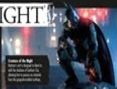
Colors of the Night Batman's cowl is made of a special material that allows him to see in the dark.

justice there participated in many of the same crimes as the gangs. Instead of joining a criminal and coming to his subterranean hideout, he decided to wage his private war on crime. He believed that to be truly effective, he had to operate in the shadows. With the most advanced technological resources at his disposal, he knew he could make a difference.