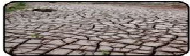
Matinding Tag-init o El Niño