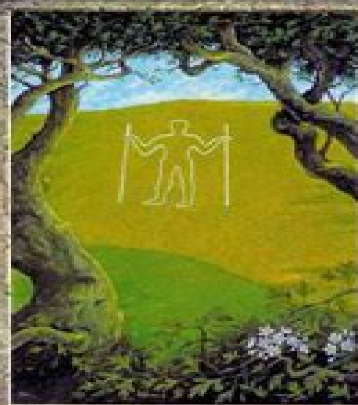
TWO OF WANDS