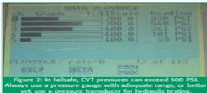
Figure 2: In failure, CVT pressures can exceed 500 PSI. Always use a pressure gauge with adequate range, or better yet, use a pressure transducer for hydraulic testing.

Consider an electronic pressure transducer, not only because of the ranges available, but for its recording capabilities. The pressure test shown is on a CVT in failure mode (figure 2). Keep in mind, the driven pulley pressure reaches 540 PSI. All this from a small, chain-driven, positive displacement pump.