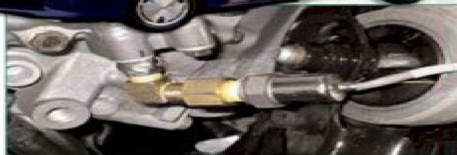
Figure 1: While Honda provides pressure taps for nearly every circuit in the unit, connecting your gauge to these taps often requires extensive plumbing.

Be careful performing pressure tests on these units: The Honda CVT can reach more than 500 PSI, so never use a conventional 300 PSI gauge.