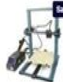
Creality3D CR - 10 $369.99 3D Printer