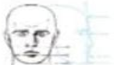
Figure It Out! Human Proportions