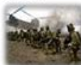
Scalable and Tailorable Joint Combined Arms Forces