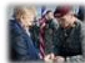
Adaptive Professionals and Institutions to operate in complex environments

The Army of 2025 and beyond will be prepared to fight and win in a complex world because resilient Soldiers, adaptive leaders, and cohesive teams are committed to the Army profession