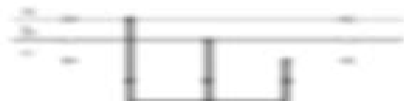
a) Symmetrical three-phase short circuit