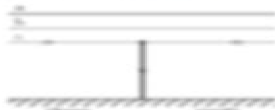
d) Single-phase with fault

• initial AC current in conductor or ground