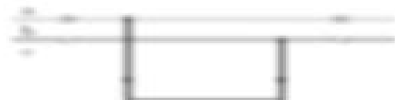
b) Three-phase without ground contact