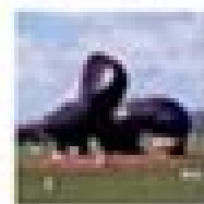
This is a photograph of a sculpture by a contemporary artist. The sculpture is made of a dark material, possibly metal or wood, and it has a smooth, polished surface. It is a large, abstract shape that resembles a human figure or a piece of furniture.