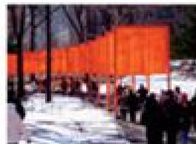
This is a photograph of a sculpture by a contemporary artist. The sculpture is made of many small, dark, rectangular blocks arranged in a grid-like pattern. It is a large, abstract shape that resembles a human figure or a piece of furniture.