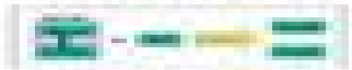
Figure 1.1: The Financial Accounting System

The financial accounting system is a system of accounting that provides information about the financial position and performance of an organization. It is a system that is designed to provide information to the management of the organization and to the external stakeholders. The financial accounting system is a part of the internal control system. It is a system of accounting that provides information about the financial position and performance of an organization. It is a system that is designed to provide information to the management of the organization and to the external stakeholders.