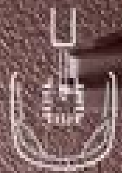
Optický optický elektronický