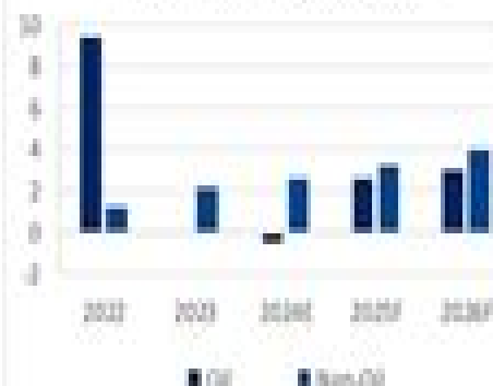
Qatar, Growth of Oil and Non-Oil GDP in Real Terms (%), 2023 - 2026F