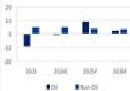
The UAE, Growth of Oil and Non-Oil GDP in Real Terms (%), 2023 - 2026F