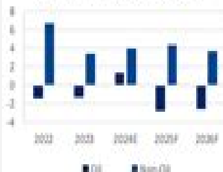
Kuwait, Growth of Oil and Non-Oil GDP in Real Terms (%), 2023 - 2026F