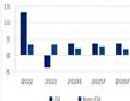
Oman, Growth of Oil and Non-Oil GDP in Real Terms (%), 2023 - 2026F