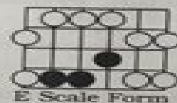
E Scale Form