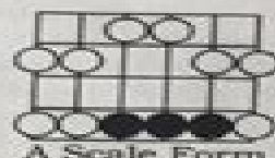
A Scale Form