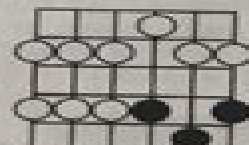
D Scale Form