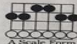
A Scale Form