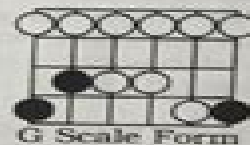
G Scale Form