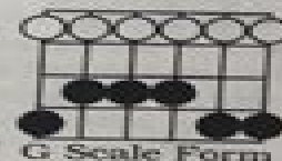
G Scale Form