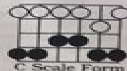
C Scale Form