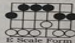
E Scale Form