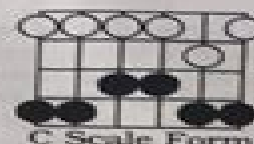
C Scale Form