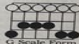
G Scale Form