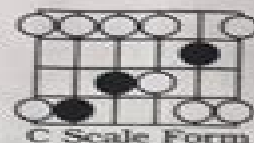
C Scale Form

When learning scales, try to play as slowly as possible for accuracy the first few times. If the first few tries are correct, it will be much easier than trying to unlearn a rush job. The best way is to play dead slow until you are familiar with the form.