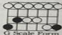
G Scale Form