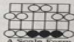
A Scale Form