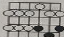
D Scale Form