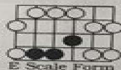
E Scale Form