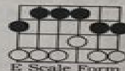
E Scale Form