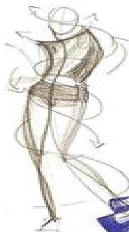
Figure Drawing for Fashion Design Vol. 1