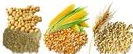
Feed raw materials: Corn, Beans, etc...