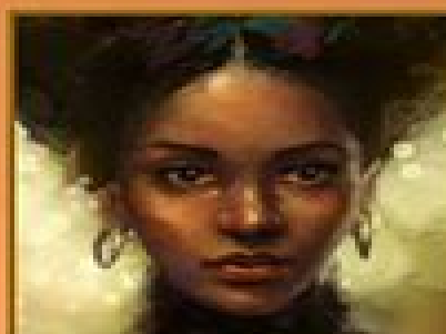
EGUNGÚN-OYA GODDESS OF FATE