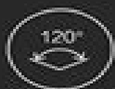
Wide Angle 120°