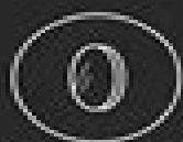
4 Glass Lens Combination