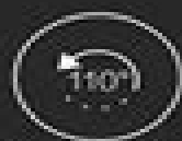
High Speed Pagoda