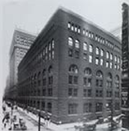
THE BIRMINGHAM CITY FACTORY, 1850-1860 THE BIRMINGHAM CITY FACTORY, 1850-1860 THE BIRMINGHAM CITY FACTORY, 1850-1860 THE BIRMINGHAM CITY FACTORY, 1850-1860

the use of the factory as the central point of the town. The first of these was the factory as the central point of the town. The first of these was the factory as the central point of the town. The first of these was the factory as the central point of the town. The first