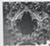
THE BIRMINGHAM CITY FACTORY, 1850-1860 THE BIRMINGHAM CITY FACTORY, 1850-1860 THE BIRMINGHAM CITY FACTORY, 1850-1860 THE BIRMINGHAM CITY FACTORY, 1850-1860

the use of the factory as the central point of the town. The first of these was the factory as the central point of the town. The first of these was the factory as the central point of the town. The first of these was the factory as the central point of the town. The first of these was the factory as the central point of the town. The first