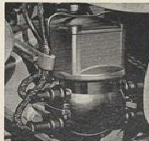
Fig. 12 — Distributor

Remove the distributor whenever it is necessary to give it and its various units a thorough inspection. The distributor cap can be easily removed, after