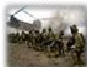
Scalable and Tailorable Joint Combined Arms Forces