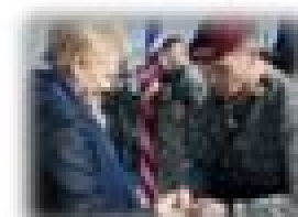
Adaptive Professionals and Institutions to operate in complex environments

The Army of 2025 and beyond will be prepared to fight and win in a complex world because resilient Soldiers, adaptive leaders, and cohesive teams are committed to the Army profession