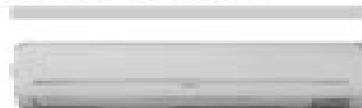
RPS – Unité intérieure