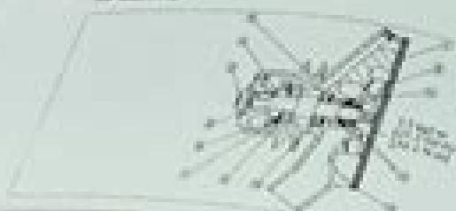
Diagram of pump assembly

1-2-3-4-5-6-7-8-9-10-11-12-13-14-15-16-17-18-19-20-21-22-23-24-25-26-27-28-29-30-31-32-33-34-35-36-37-38-39-40-41-42-43-44-45-46-47-48-49-50-51-52-53-54-55-56-57-58-59-60-61-62-63-64-65-66-67-68-69-70-71-72-73-74-75-76-77-78-79-80-81-82-83-84-85-86-87-88-89-90-91-92-93-94-95-96-97-98-99-100