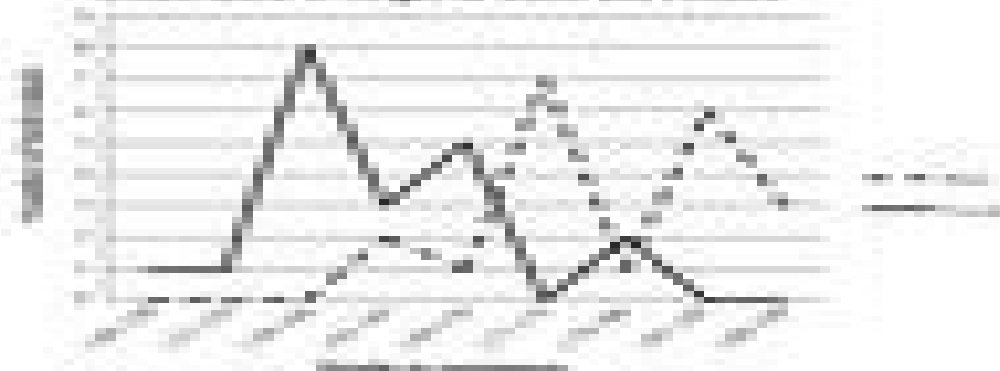
Percentage of Water and Hydrogen