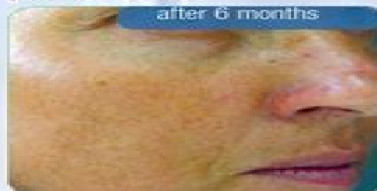
after 6 months

Less age-spots - Less wrinkles - Less blemishes