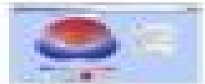
Figure 1: Unit Circle

For this activity, we will use a unit circle to model Earth's rotation. The unit circle is a circle with a radius of 1 unit. The circumference of the unit circle is 2\pi units. The unit circle is a circle with a radius of 1 unit. The circumference of the unit circle is 2\pi units. The unit circle is a circle with a radius of 1 unit. The circumference of the unit circle is 2\pi units.