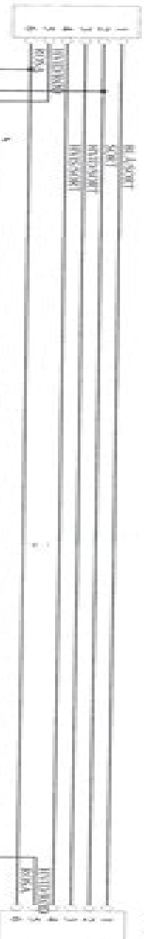
TL MOTOR Q1VAP2