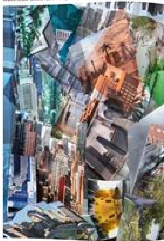
Metropolis (Subtropical NYC) 2000 Anastasia Samohoun 5'10 1/2

The original artwork (Metropolis) by Russian-born Canadian artist Anastasia Samohoun (born 1970) is a dense, colorful collage of various elements, including architectural forms, organic shapes, and vibrant colors like orange, red, green, and blue. It appears to be a mixed-media piece with many small, overlapping images and textures.